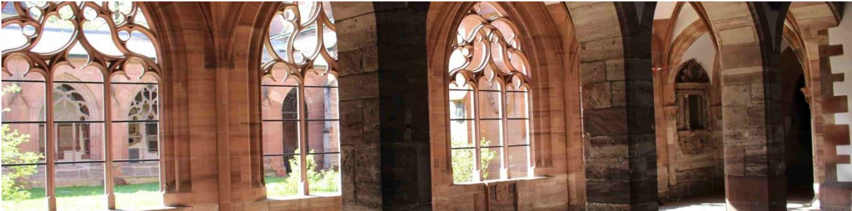
Legende: Kreuzgang des Basler Münsters auf dem Weg in die Niklauskapelle.

Come and join us in our singing and praying for justice, peace and integrity of creation!