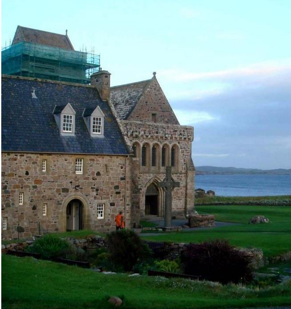
Foto: Die Abbey auf Iona

Herzlich willkommen beim Iona-Abendgebet. Wir freuen uns, dass Sie dabei sind, mitfeiern und mitbeten.