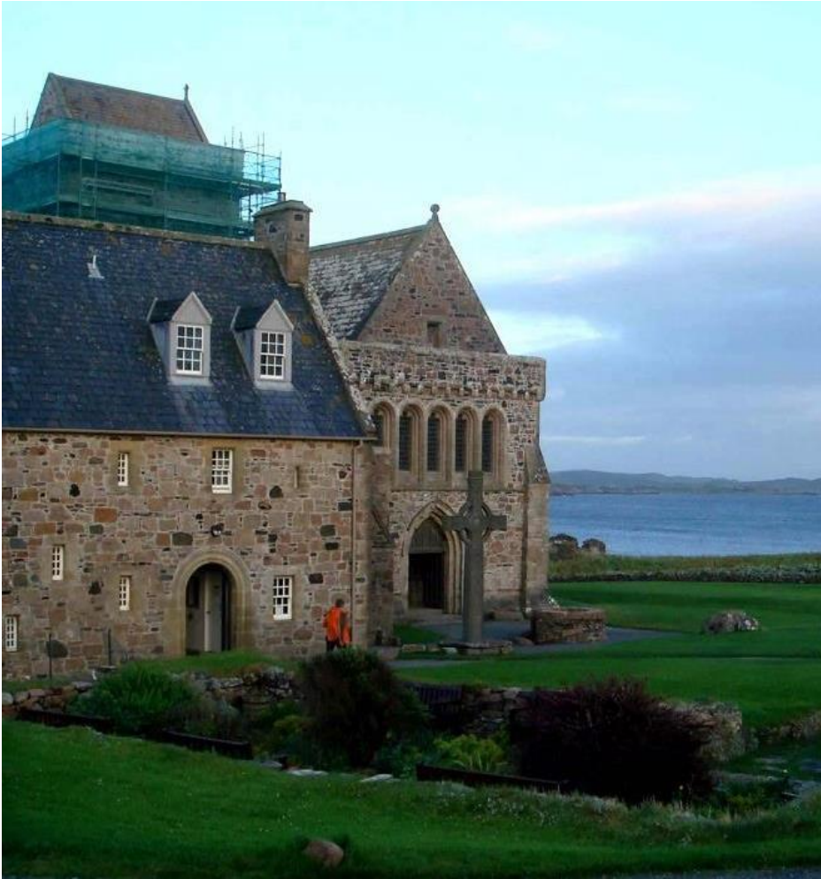
Foto: Die Abbey auf Iona